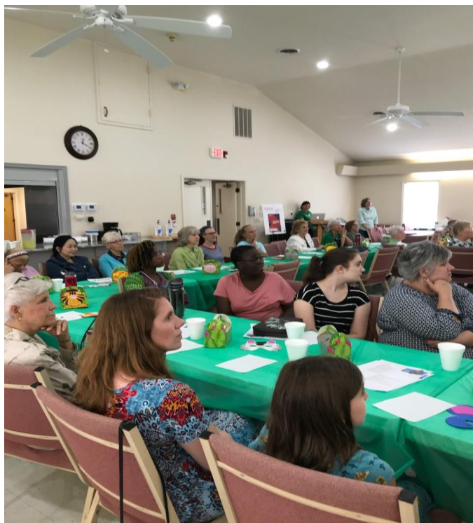
Attentive members and friends